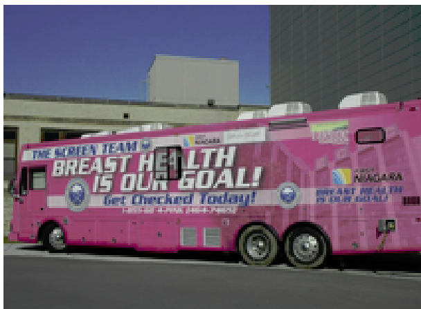
Mobile mammography unit

The Refugee and Immigrant Breast Health Awareness Project is a culturally competent, evidence-based, breast health education program, designed to reach out to refugee and immigrant women. It features well trained health educators, clinical staff, and a survivor who will teach participants about breast cancer and the importance of screening. The program also offers training to healthcare providers on cultural competency and working effectively with the refugee and immigrant population. Translated educational material and trained interpreters are available to address language and cultural barriers.