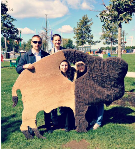
Serbian delegation showing their Buffalove

Here's our list of upcoming delegations: