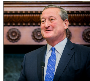
MAYOR JIM KENNEY CITY OF PHILADELPHIA