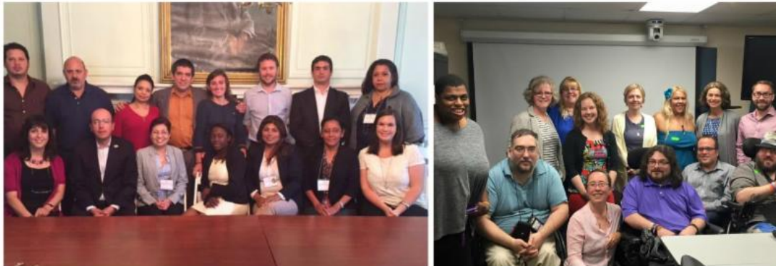
(Left to Right) Latin American Delegation (Combating International and Domestic Human Trafficking); Canadian Delegation with representatives from WNY Independent Living and Self Advocacy Association of NYS (Disability Advocacy)

IIB's International Exchanges & Education Department hosted an array of international visitors this month through the Department of State's International Visitors Leadership Program . Buffalo was able to showcase their strengths in the fields of Disability Advocacy, Climate Change and Clean Energy, and Combating International and Domestic Human Trafficking. Thank you to all who met with our various delegations throughout the month -- we can't implement this program without our professional partners!