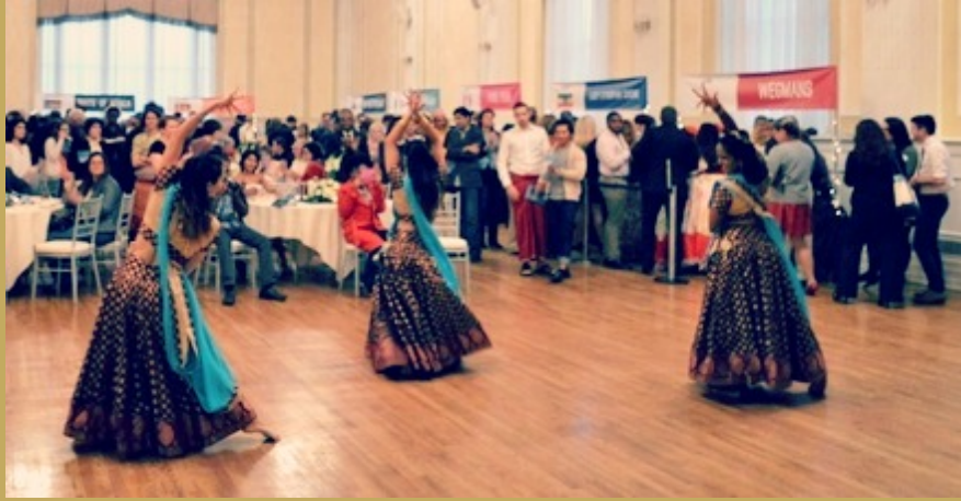
2014 The Buffalo News